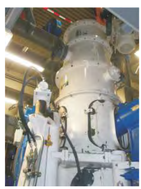
ATLAS Roller Mill with Blower