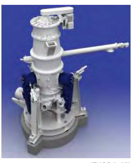
ATLAS Roller Mill