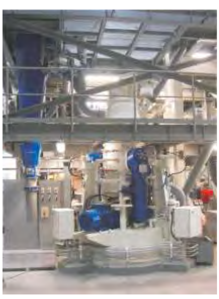
SCIROCCO Classifier with ATLAS Roller Mill

The ATLAS is a roller air-swept mill designed for continuous operation with minimum maintenance. The fundamental difference between the ATLAS and other table-roller mills is the bearing arrangement for the grinding table which is incorporated into the base of the mill. This enables an operation with a standard design gearbox instead of the typical gearboxes with integrated bearing section with long delivery times. The milling force is no longer transmitted to any foundation, but directly transferred to the roller arms making sure that civil work, erection and operation are easier to be handled and therefore much more inexpensive.