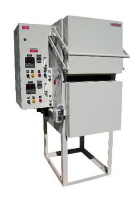
K-121220-D shown with inert gas flow control instrumentation

This type of furnace construction requires a minimum of floor space. The upper door rises vertically so the hot face is away from the operator, while the lower chamber door is a hinge type construction. The lower furnace chamber is equipped with a high temperature fan for improved temperature uniformity. A quench tank can be stored under the lower furnace chamber and can be rolled out when needed.